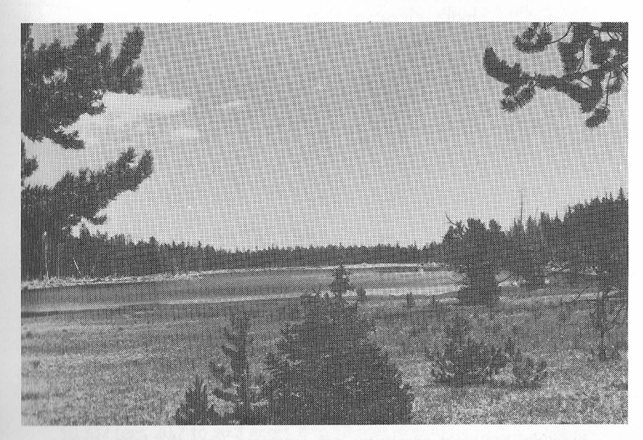
Goose #2 Little fishing pressure occurs on this lake because drawdown causes the shoreline to become mucky.