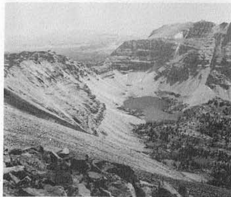
AMETHYST, BR-28. 53 acres, eleva-

lying in the center of the cirque. Excellent campsites with plenty of horse feed and running water. Lots of insects. Popular Scout lake. Excellent fly fishing for cutthroat trout. Natural reproduction.