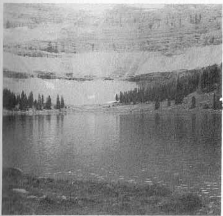
ALLSOP, BR-42. 12 acres, elevation 10,650 feet, maximum depth 21 feet, average depth 7 feet. 8 miles by Forest Service trail from the Bear River Boy Scout Camp. Stay on the left hand fork to the east. Diamond-shaped lake

Plan your trip and it will be a good one!