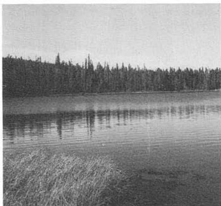
HIDDEN, GR-149. 5 acres, elevation 10,200 feet, maximum depth 11 feet,

the trail. A small, round lake lying at the edge of the conifers at timberline. Campsites and horse feed. Open shoreline. Some boggy meadow partially encompasses lake. Stocked experimentally with brook trout.