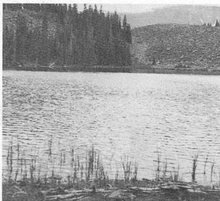
DINE, GR-148. 3 acres, elevation 10,500 feet, maximum depth 10 feet, average depth 5 feet. From Beaver Lake

10,900 feet, maximum depth 28 feet, average depth 12 feet. 10 miles south of the Hole-in-the-Rock Ranger Station on well-marked Forest Service trail to Beaver Lake; then 1 mile southwest. No trail, rough terrain. A large lake lying in a steep, rocky-conifer basin. Excellent campsites with horse feed at Beaver Lake. Rock slides come into the lake along the west side. Some open shoreline for fly fishermen. Seldom visited and generally fast fishing. Stocked with cutthroat trout.