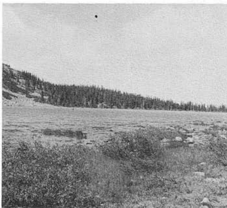
COFFIN, GR-144. 28 acres, elevation

BEAVER, GR-147. 38 acres, elevation 10,500 feet, maximum depth 25 feet, average depth 10 feet. From Hole-in-the-Rock Ranger Station, 10 miles south on well-marked, good Forest Service trail. Excellent campsites with crystal-clear drinking water. Good horse feed in the area. Shoreline mostly timbered with some open meadow area for fly fishermen. Some good stream fishing in the area. Excellent fishing for brook trout, with an occasional cutthroat taken. Some natural reproduction. Stocked with brook trout.