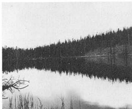
FIGURE-EIGHT, WR-56. 3 acres, elevation 10,700 feet, maximum depth 5 feet, average depth, 3 feet. From Chepeta Lake, ¼ mile up the north-west stream. Rough terrain, no trail. Campsites and horse feed in the area. A small, cold, shallow lake inhabited by extremely wary cutthroat trout. Partly open, marshy shoreline. Seldom visited. Natural reproduction.

HIDDEN, WR-63. 12 acres, elevation 10,500 feet, maximum depth 48 feet, average depth 27 feet. A deep, elliptical lake lying in a small pocket in dense conifers. Few campsites and little horse feed. No open shoreline. From Paradise Park Reservoir 15 miles by Forest Service trail to "fork" in trail, leave trails and head west for a good mile over rough terrain. Hard to find. Stocked for the first time in 1963 and 1964 with brook trout. Should be a good one!